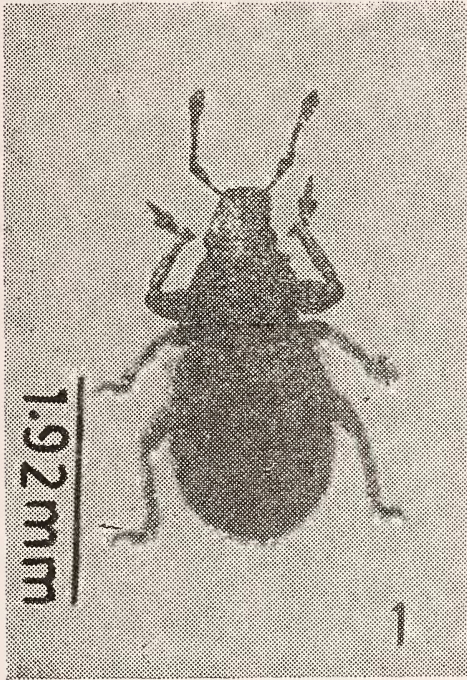
Fig. 1. Strophosomoides pahalgamensis sp. nov.: Adult.

pattern formed by pale brown scales and setae. Scutellum indistinct.